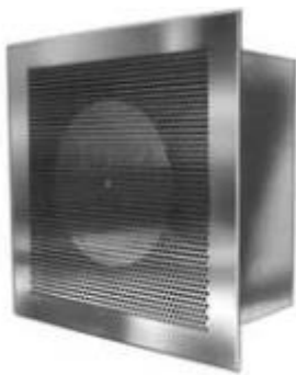
Stainless Steel Perforated Diffuser