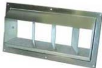
Stainless Steel Drum Louver