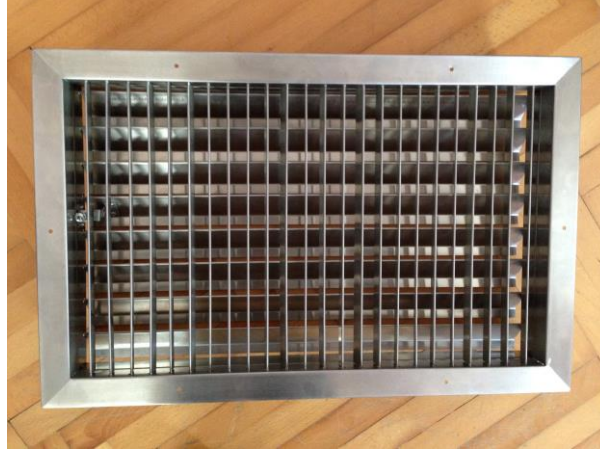
STAINLESS STEEL GRILLES