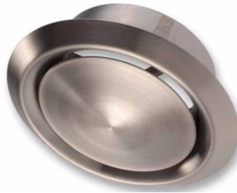
STAINLESS STEEL VALVES