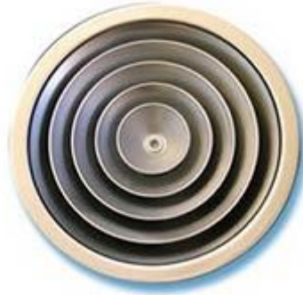
STAINLESS STEEL CIRCULAR CEILING DIFFUSERS