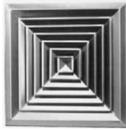
STAINLESS STEEL SQUARE CEILING DIFFUSERS