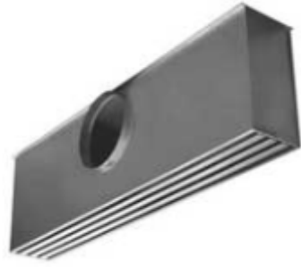
Stainless Steel Adjustable Slot Diffuser